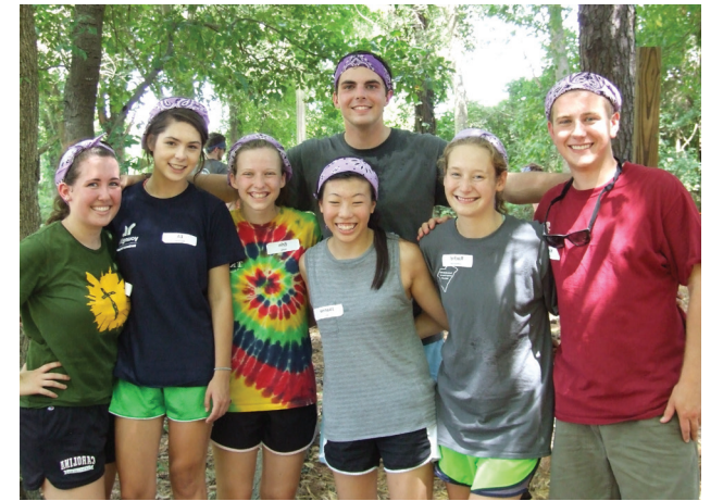
below: The purple team of First Year Scholars are all smiles despite the heat at the FYS Retreat.