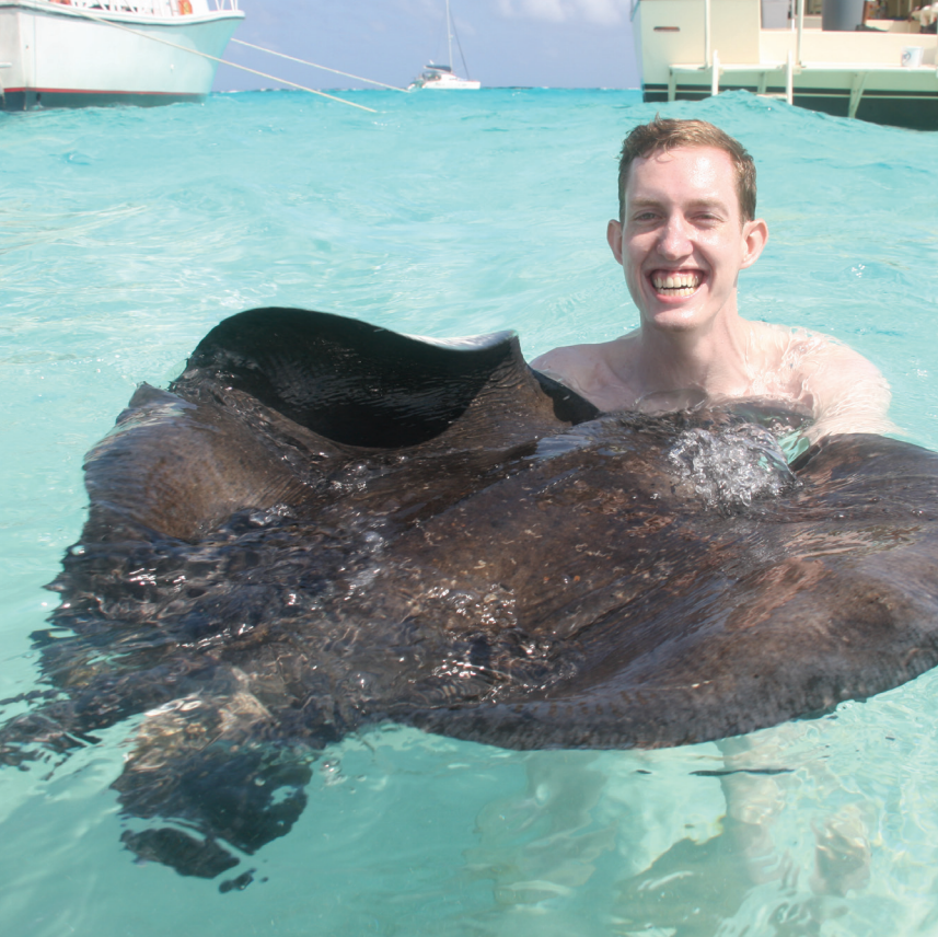
Miller's favorite aspect of the scholar community is the incredible friendships fostered. One of his most memorable adventures was spring break with a group of fellow scholars.